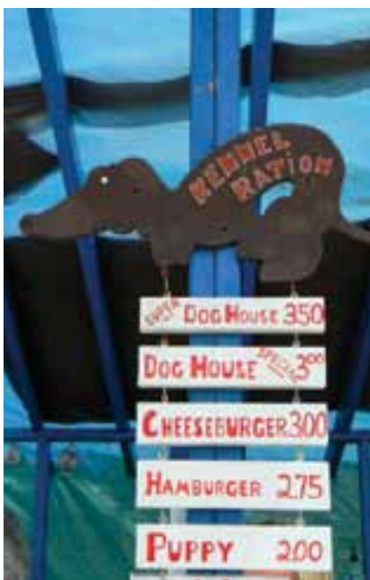
A vintage Dog House menu

Pat and Estelle ran The Dog House every summer until Pat’s passing in 1979. Estelle ran it with the help of her devoted employees for a few more summers, closing the order window for good in 1984. She passed away in 2006 at the age of 90.