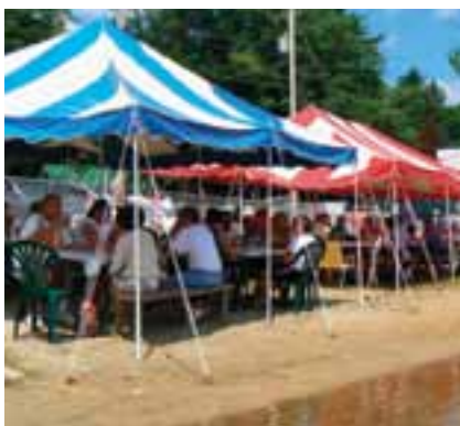
Big tents are set up on Wright’s Beach for Dog House Weekend.