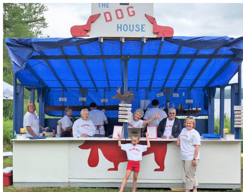
The Dog House crew on Wright's Beach back in 2018. Look for them at our 75th Jubilee party at Sunset Hill Educational Institute (SHEI).

In 2005, during the 55th anniversary of the Blaisdell Lake Protective Association (BLPA), members voted unanimously to accept a remarkable and generous gift: Wright's Beach, donated by longtime lake supporters