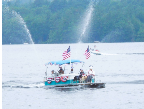
The Fourth of July Boat Parade is a beloved lake tradition.

Over the next century, the lake continued to support local industry. Eventually,